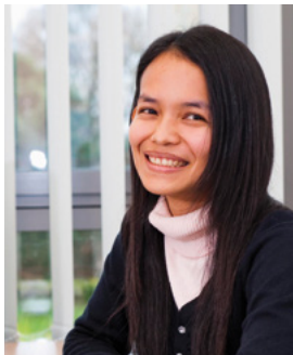
Skulrat from Thailand

"I was very happy to participate in the Quality Engineering course. All the professors, staff and students were very friendly and helpful, and the study support system OSCA was very useful. I learned many new things in the technical modules, and it was a pleasure to master tasks with practical applications. I took part in many activities for students where you can meet new friends. The course was a good opportunity to study not only engineering moduls, but also English and German."