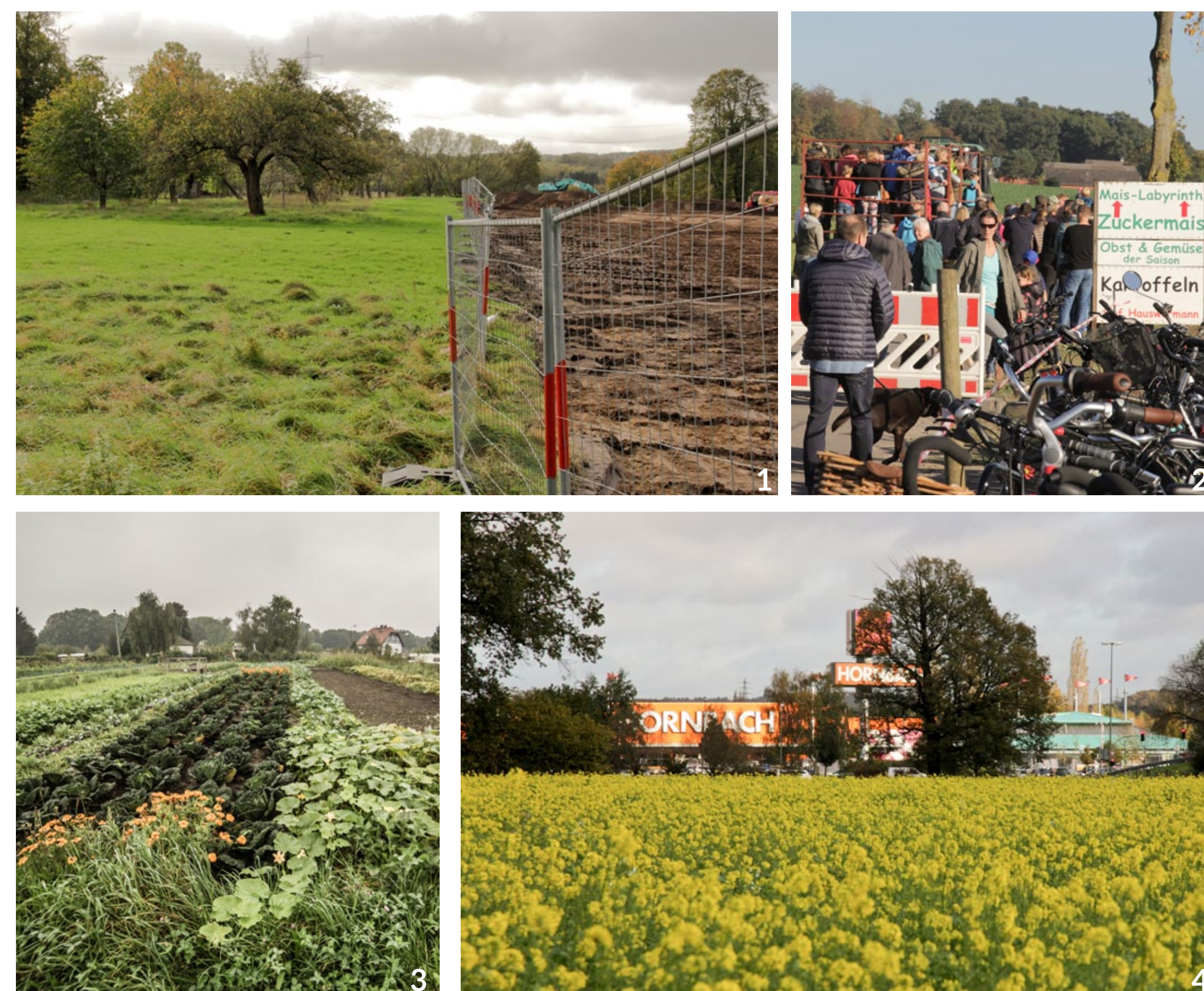
Fig. 1: Impressions from the “Green Fingers”.

In order to preserve this system of green and open spaces, it is necessary to highlight the potentials of urban agriculture and to strengthen their position in politics and planning. Prospects for urban agriculture will only be considered in urban planning concepts if the agricultural economy manages to establish and tighten its relationship with civil society, e.g. through direct marketing of local produce, events and spatial experiences.