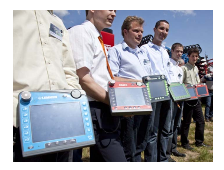
Fig. 4: CCI ISOBUS terminals of the companies Lemken, Rauch, Kuhn, Krone, Amazone and Grimme (same hardware, different foil with corporate design)

Figure 4 shows the CCI ISOBUS terminals of the companies Lemken, Rauch, Kuhn, Krone, Amazone and Grimme, all with the same hardware, but different foils with the corresponding corporate designs. The terminals have been connected to different agricultural implement in a cross-manufacturer test (6 terminals x 6 implements = 36 combinations) resulting in a completely successful operation.