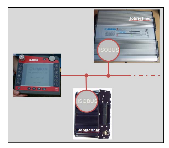
Fig. 1: Cross-manufacturer combination of an SOBUS terminal and control units (ECU)